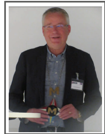
NMKL's chairman opens the meeting, wearing the "chairman necklace".